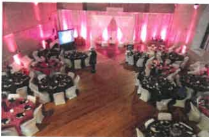
Our Lady of Victory McGuinness Hall