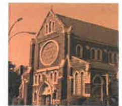
Our Lady of Victory Church 583 Throop Avenue Brooklyn, NY 11216

Mass Schedule Sundays: 9 AM Tuesdays: 11 AM