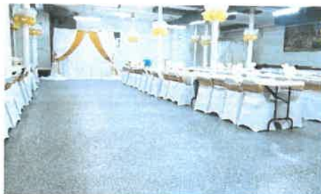
Holy Rosary Lower Church Hall